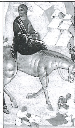
Do you see the children?

In the Gospel of St. Matthew, we hear about the children who were in the temple. They were shouting "Hosanna" to our Lord, Jesus Christ. "Hosanna" means something like "Lord, save!" They shouted because they were happy because Jesus had come. He had come into Jerusalem, riding on a donkey.