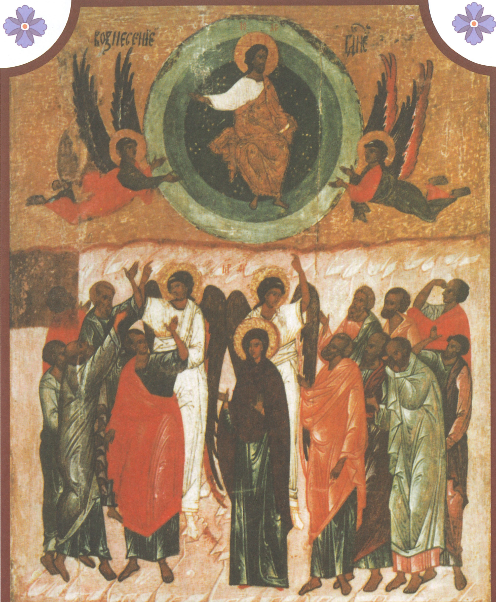
HOLY ASCENSION of Our Lord