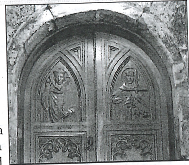
These doors on the church in Paisley, Scotland show Saint Mirin on the left and his helper, St. Columba on the right.

Saint Mirin ended up in Paisley, Scotland (near Glasgow). He built the first church there, and later on, a big beautiful church and abbey were built there. You can see it if you visit! Some people in Scotland might not know about this special saint who helped bring Christianity to their land, but now you do! And you can follow his brave example as you share your faith with others too.