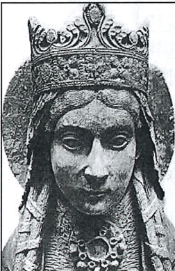
A statue of the saint in France

Saint Chlotilda was queen of France about 1,500 years ago. Her husband was Arian (he didn't believe that Jesus is God), but Chlotilda convinced her husband to believe the truth of the Holy Trinity—Father, Son, and Holy Spirit. They baptized their children in the name of the Holy Trinity. Then, after that, more people in France followed their king's beliefs too.