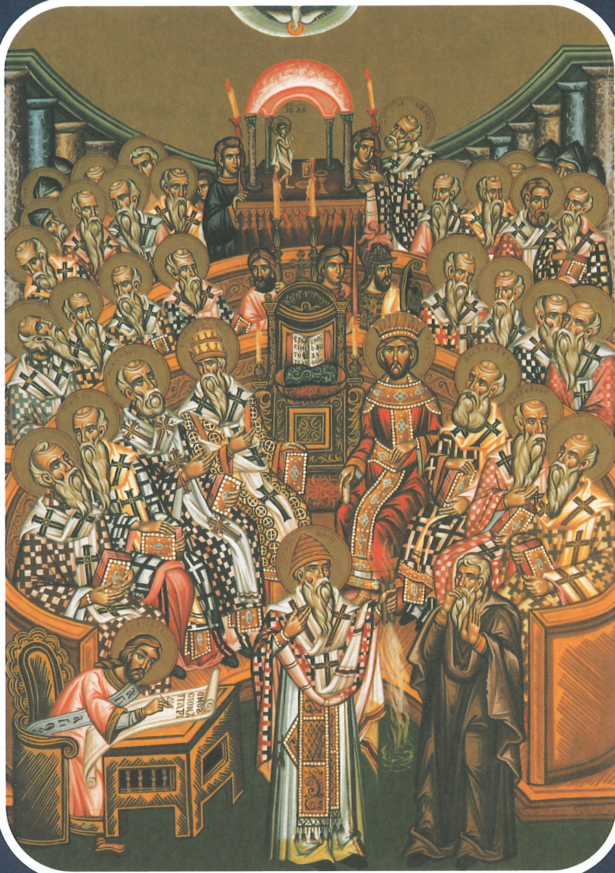
THE FIRST ECUMENICAL COUNCIL