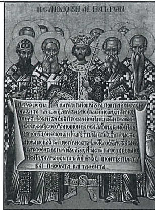
The Holy Fathers

Did you know the bishops of our Orthodox Church have important meetings too? Yes, they have had important meetings ever since the very beginning of the Church. Today, we celebrate one of the very most important meetings that ever happened in our Church. It was a council that happened 1,700 years ago. The bishops talked about who Jesus Christ is (some people had some mixed-up ideas about Him!) They talked about celebrating Easter (Pascha). They talked about baptism. They talked about other things too. That meeting lasted a whole month long!