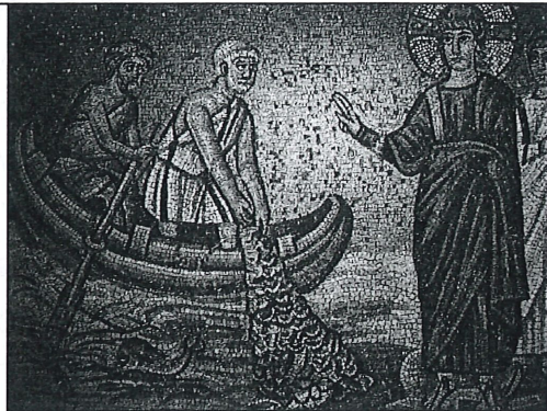
Some of Christ's disciples were poor fishermen!

Today, in the Gospel reading, we hear about how Jesus started picking His disciples. And how did He choose them? Did He choose the smartest or the fastest or the richest or the most athletic? No, not really! He started with the apostles Andrew and Peter. They were poor fishermen, casting a net out into the sea! But Jesus knew that they would be good followers. He knew that they would learn from Him, and one day they would teach other people about God's truth!