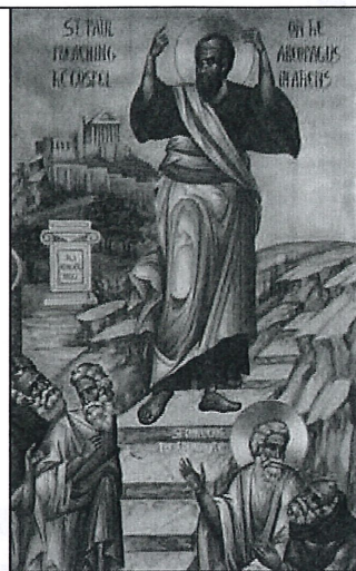
Saint Paul preaching to unbelievers in Athens, Greece

We can follow Saint Paul's example too. When we know someone who isn't a Christian, we can pray for him or her. We always want God to save that person and keep him or her close. Sometimes we might want to win an argument with an unbeliever or show that we know a lot, but let's follow Saint Paul and his "heart's desire and prayer to God"!