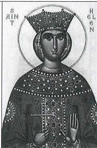
Saint Helen used her riches to help others and help the Church!

A rich man asked our Lord, Jesus Christ, how he could go to heaven. He was a faithful man, and he tried to do all the right things. But Jesus told him that he needed to do one thing. He needed to sell all his things and give them to the poor. Wow! How could this man ever do that?